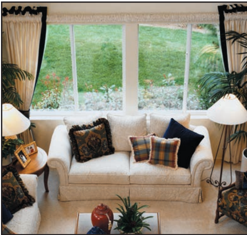
2 & 3 Lite Sliders Create a custom look for a special room