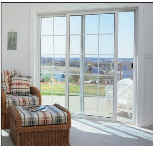
Sliding Patio Door Create light and inspirational views in your living space