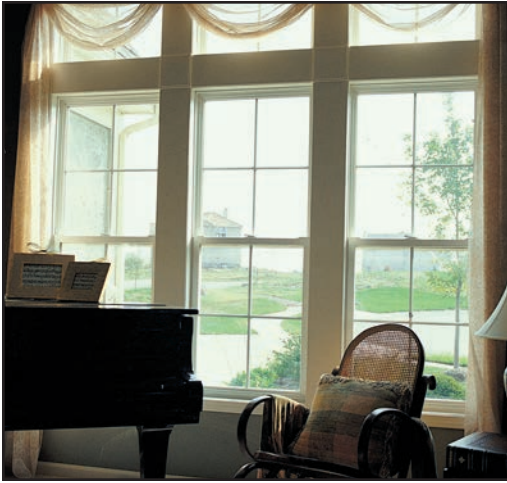
Double-Hung and Transom Windows Bring added height and light to any room setting