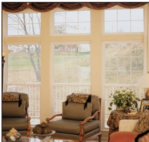
Picture Window Walls Offers maximum viewing area and opens the room to the outside beauty