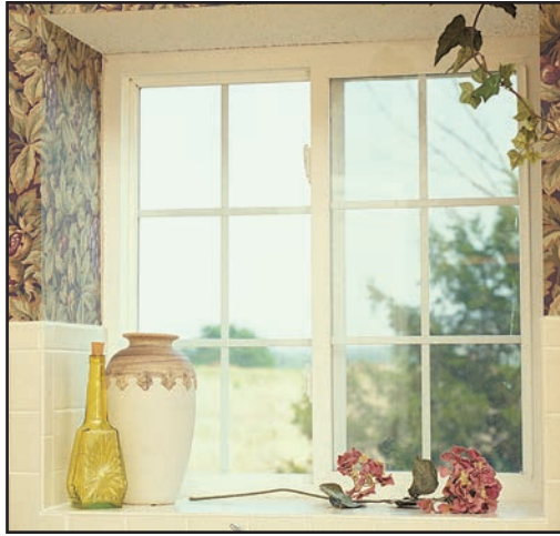
Slider Windows A great choice when space is at a premium