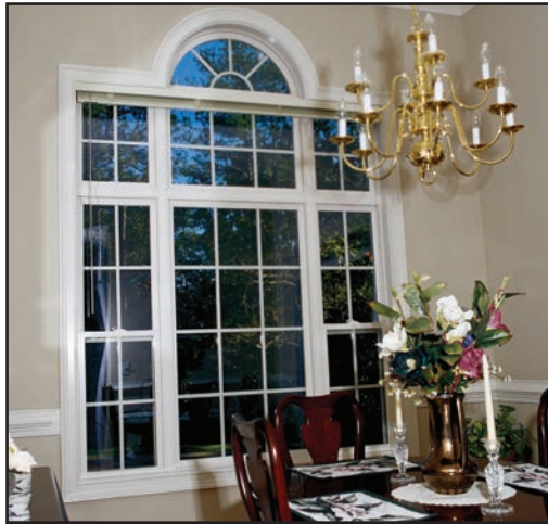
Combination Windows Dramatically emphasize the living space